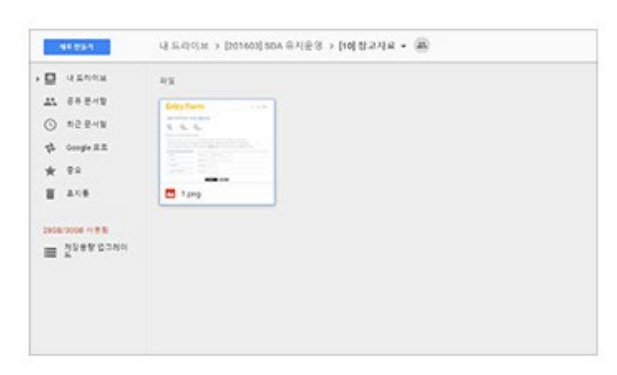
2. Upload video on your personal drive account