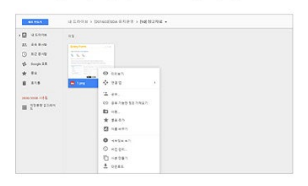
3. Select the file, click on your right side of the mouse, and click "share"