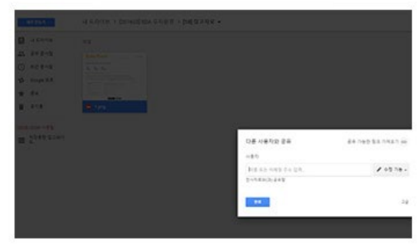
4. Type in SDAOC google account and click "share"

b. Save the video files on a USB flash drive and ship it to SDAOC.